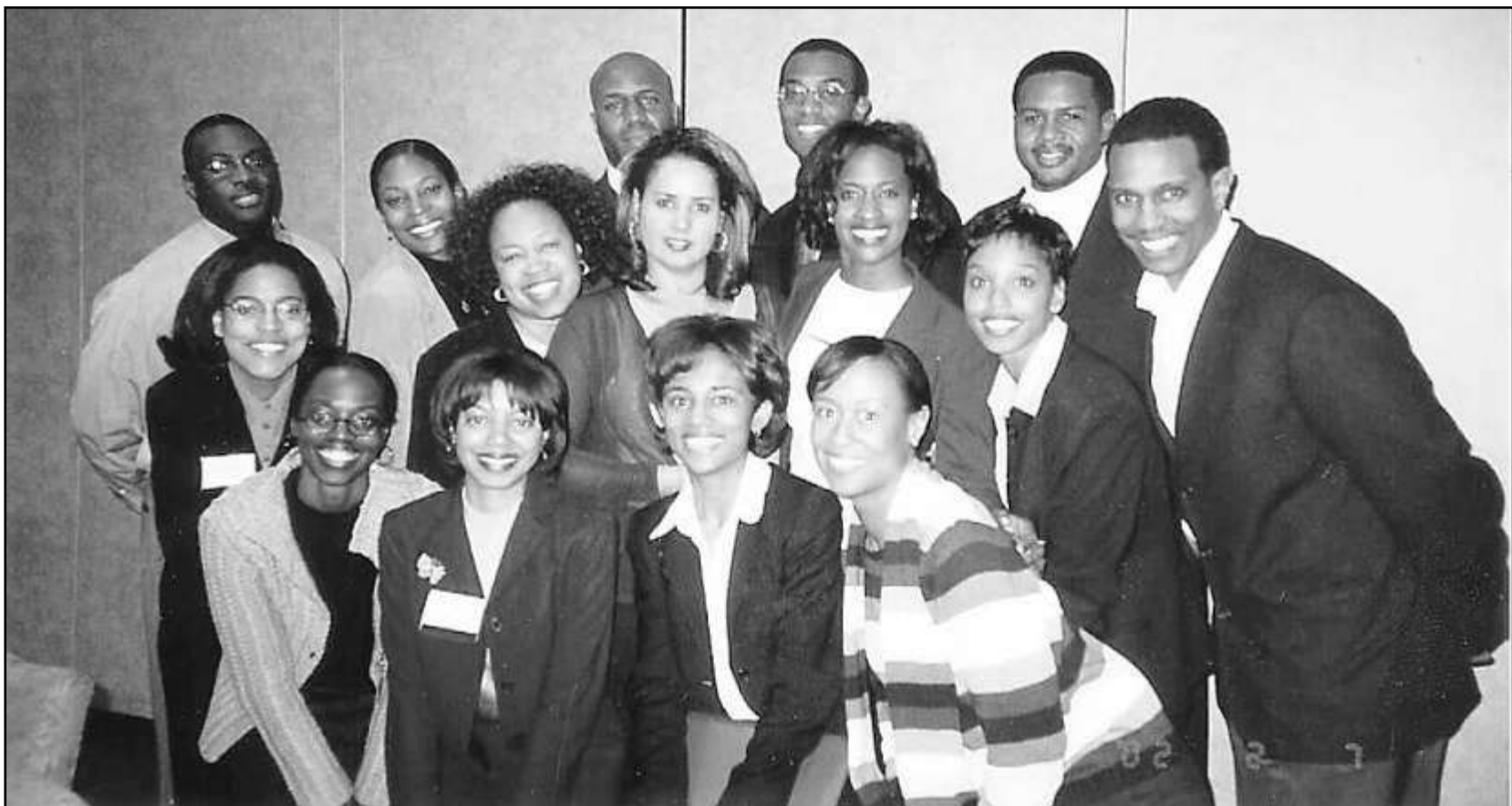
FOUNDING MEMBERS OF THE URBAN LEAGUE YOUNG PROFESSIONALS-PITTSBURGH

The National Urban League is one the nation's largest community-based movements committed to advocating African-Americans to enter the eco-