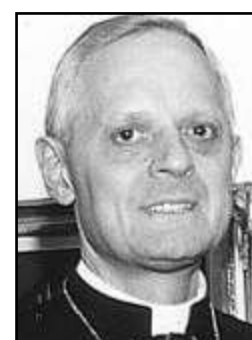
BISHOP DONALD W. WUERL Diocese of Pittsburgh