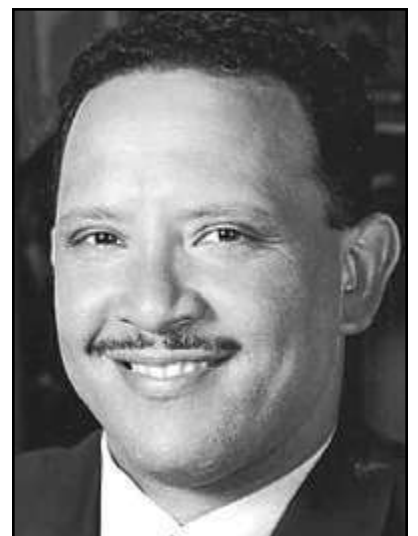
MARC H. MORIAL President and CEO National Urban League